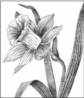
POETRY Page 10